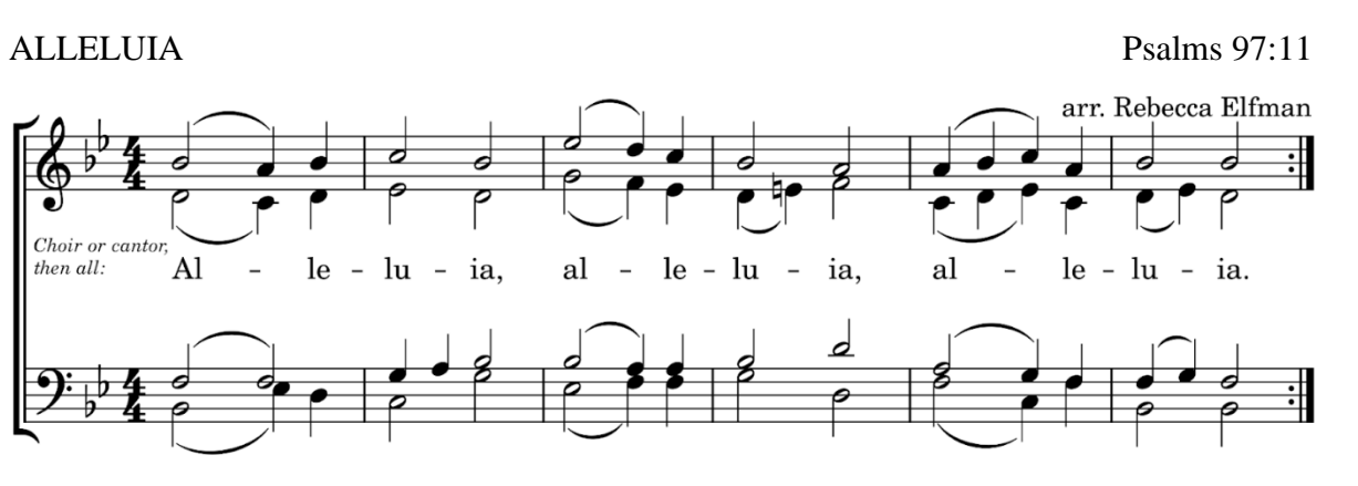
C: Alleluia, alleluia. R: Alleluia, alleluia, alleluia. C: Light dawns for the just; gladness, for the honest of heart. R: Alleluia, alleluia, alleluia.

This is the Word of the Lord. R. Thanks be to God.