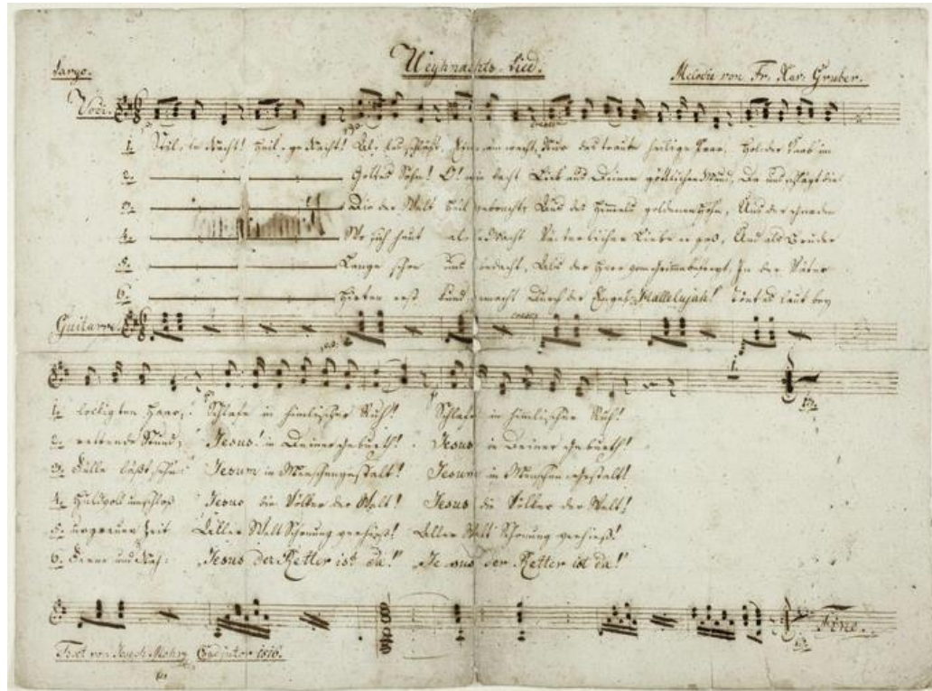
Above is the earliest surviving manuscript of "Silent Night," in the handwriting of the Rev. Joseph Mohr.

On Christmas Eve 1818, in the church of St. Nicholas in Oberndorf near Salzburg, "Stille Nacht" ("Silent Night") was sung for the first time.