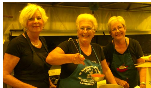
KITCHEN CREW - that were there early preparing and heating up all that delicious polish food.