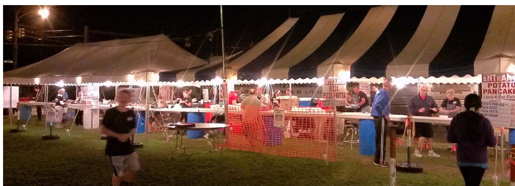
LIGHTS ARE ON - as the sun goes down to brighten up the areas.