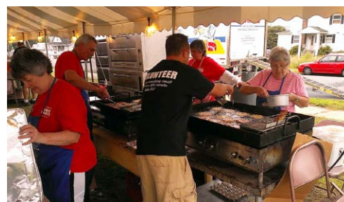
POTATO PANCAKES was always a popular place.