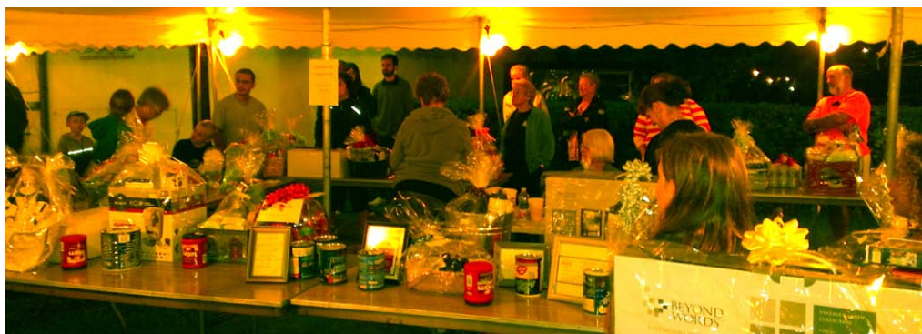
BASKET RAFFLE - where people were waiting to hear if they were the lucky winner of any of these great baskets!