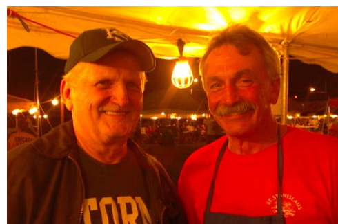
VOLUNTEERS - still find time to enjoy the festivities