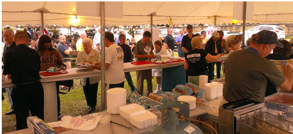
FOOD STAND - Kielbasa Sandwiches, Golompki, Halushki, Pierogies, Sausage and Peppers, Steak n' Cheese, Chicken Cheese Steak and much more! These volunteers were very busy!

The parish held it's 6th Annual Block Party Aug 22-23 on the parish grounds. Large crowds enjoyed live entertainment, traditional Polish foods, kids games, crafts, raffles, and a treasure tent. Exceeding this year's goals, this year's Block Party saw a new layout, games, and offerings. Join us next year as we continue to grow!